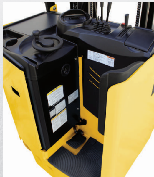
Ergonomic Operator Compartment & Intuitive Controls